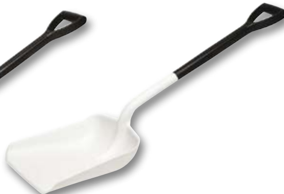
HCH - 29 HCH - 30 HCH - 31