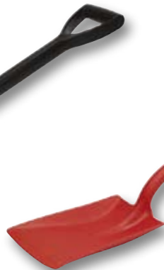
HCH - 04 HCH - 05 HCH - 06