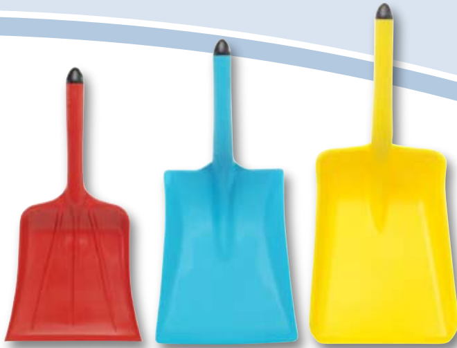
HCH - 01