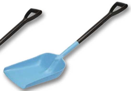
HCH - 09 HCH - 10 HCH - 16