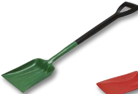
HCH - 02