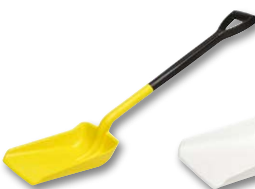
HCH - 24 HCH - 25 HCH - 26