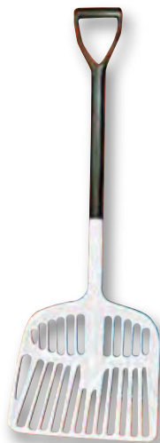
HCH - 94 HCH - 95 HCH - 96