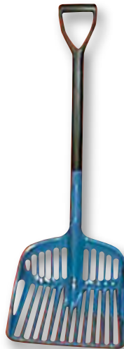
HCFD94 HCFD95 HCFD96