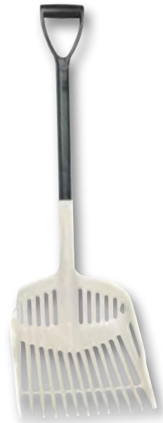
HCH - 84 HCH - 85 HCH - 86