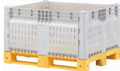
Vented KitBin (#IBCK100VGR)