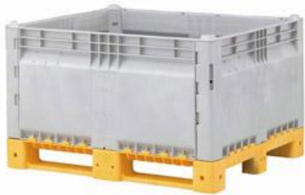
Solid KitBin (#IBCK100SGR)